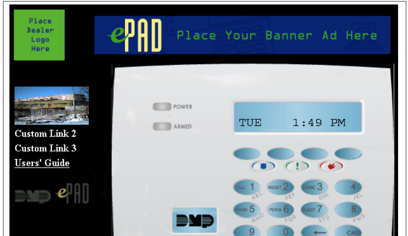
Figure 2: Sample of how the ePAD could look on the screen

You may also press the keys on the keyboard that correspond to the keys on the ePAD. Press the digit keys (0 through 9) as you would on a standard keypad. You can also use the number pad and the numbers on the top of your keyboard to enter information. Be sure that the Num Lock is set to use the number pad.